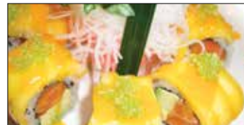
Mango Hawaiian Roll