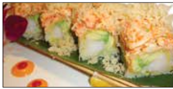
Snow Mountain Roll