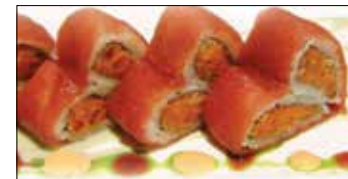
Sweet Heart Roll