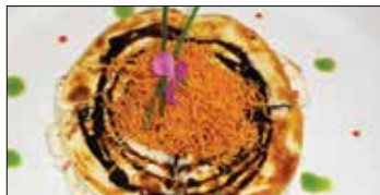
Blue Crab Fajita