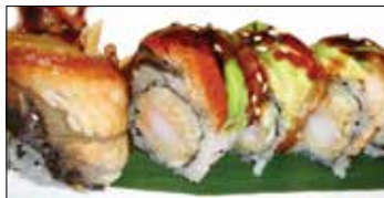
Special Dragon Roll