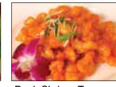
Rock Shrimp Tempura