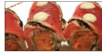
Crazy Tuna Roll